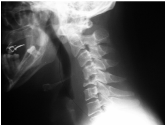
Figure 1. Lateral cervical radiography shows marked decrease in the height of the 5th vertebrae corpus in consistency with compression fracture.

Chest X-ray was normal, and plain radiography of the cervical spine showed significant kyphosis and compression fractures of C5 vertebrae.