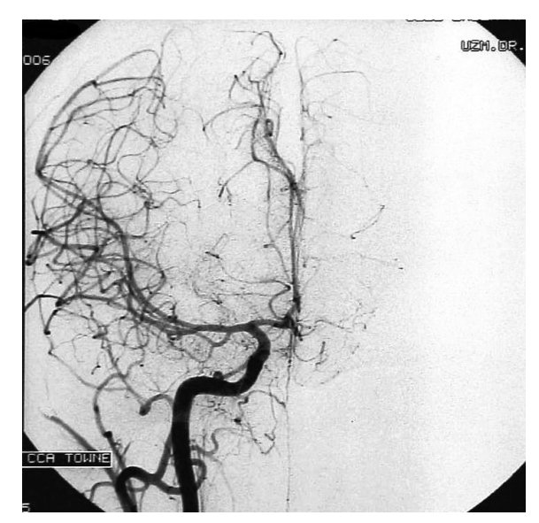
Figure 2. The cerebral angiography on the fifth day.

trast-enhanced cranial MRIs revealed a lesion in the right interhemispheric region which was thought to be a subdural empyema (Figure 3). The patient was transferred to the neurosurgery clinic and the empyema was drained by performing right occipital craniotomy,. The lodge was irrigated. Postoperative drainage was applied for 48 hours. The patient showed a rapid clinical recovery in the postoperative period. E.coli was isolated from the culture of the drainage fluid. Following six weeks of vancomycin, ceftriax-