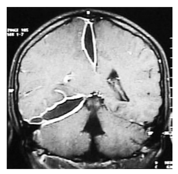
Figure 3. MRI after angiography.

one, metronidazole therapy, the patient was discharged with an improved health state and without any deficit.