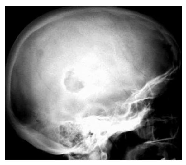
Figure 1. Lateral skull radiograph shows a well marginated osteolytic lesion without a sclerotic rim on the parietal region.

around the lesion on contrast enhanced T1-weighted image (Figure 2B), and markedly high signal intensity on T2-weighted image (Figure 2C).