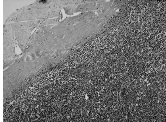
Figure 2. On microscopical examination, the mass lesion that appeared to originate from the meninges was composed of atypical plasma cells that were characterized by eccentric nuclei and abundant cytoplasm. The patient was diagnosed as having an intracranial plasmacytoma (Hematoxylin and eosin staining at 100 times magnification).

sed of atypical plasma cells that were characterized by eccentric nuclei and abundant cytoplasm. Immunohistochemical analysis proved positive staining for kappa light chain and epithelial membrane antigen. Therefore, the patient was diagnosed as having an intracranial plasmacytoma (Figure 2). She experienced prompt improvement and her physical examination was unremarkable apart from obscure left-sided hemiparesis at one week following surgery. Based on the fact that the mass lesion appeared to invade the brain parenchyma, the decision was made to proceed with radiation therapy. In the interim, based on the bone marrow aspiration as well as the complete blood count, the blood chemistry, the serum protein electrophoresis, the urine protein electrophoresis and the skeletal survey, she was diagnosed as having relapsed multiple myeloma and was treated with second-line chemotherapy accordingly. She was alive at the follow-up visit one year following surgery.